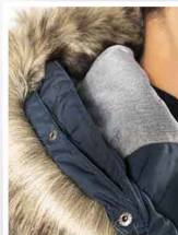
Lined and padded hood with detachable fake fur