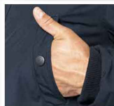
Pocket with press stud flaps