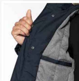
Interior pocket hook and loop closure