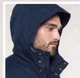
Lined, contrasting and quilted hood