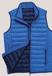
♂ K6113 K6114 K6115 > P. ♀ 247 ↓