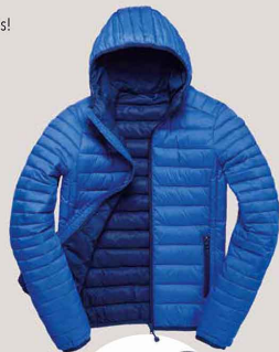
♂ K6110 K6111 ♀ K6112 > P. 247 ↓