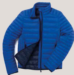
♂ K6120 ♀ K6121