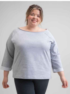
M128 | Flash Dance Sweat

Organic or In-Conversion Cotton 150gsm Single Jersey