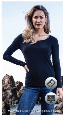
Women's Slim Fit-T Longsleeve 4085F

Modern single jersey longsleeve T-Shirt with elastane in rib neckline, wide scoop neckline, produced of combed cotton with elastane for better comfort. The longsleeve T-Shirt has a fitted cut and is made with side seams.