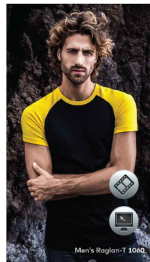
Men's Raglan-T 1060

Double-coloured single jersey T-Shirt with raglan sleeves and neck binding in contrast colour, produced of combed cotton. The raglan T-Shirt has a classic cut and is made from tubular fabric.