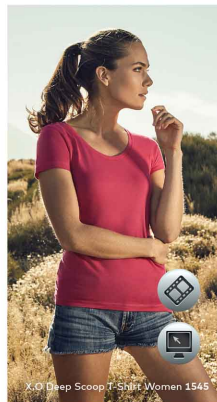
X.O Deep Scoop T-Shirt Women 1545

Unique single jersey T-shirt with a low neckline and self-fabric collar, made from long staple combed cotton. The particularly smooth surface and flowing fabric give the shirt a unique, elastic and silky finish. The T-shirt has a slim fit and is made with side seams.