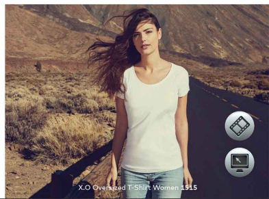
X.O Oversized T-Shirt Women 1515