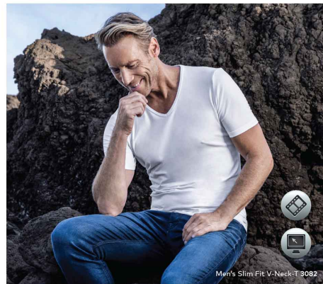
Men's Slim Fit V-Neck-T 3082