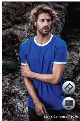
Men's Contrast-T 3070

Double-coloured single jersey T-Shirt with elastane in rib neckline and contrast sleeve and neck bands, produced of combed cotton. The contrast T-Shirt has a classic cut and is made from tubular fabric.