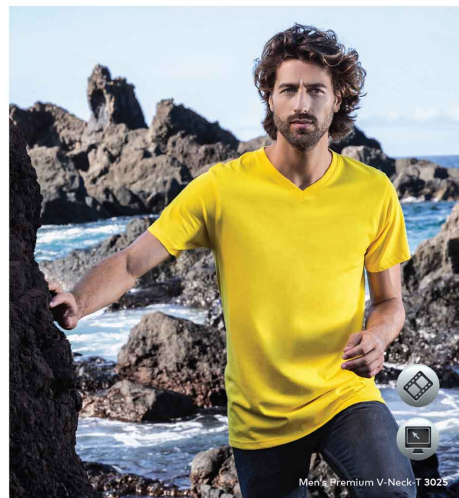
Men's Premium V-Neck-T 3025

Classic single jersey v-neck T-Shirt with elastane in small rib neckline, produced of long staple combed cotton, the particularly fine surface is highly suitable for any kind of textile finishing. The T-Shirt has a modern cut and is made from tubular fabric.