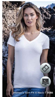
Women's Slim Fit V-Neck-T 3086

Modern single jersey v-neck T-Shirt with neck binding for men and with elastane in small rib neckline for women, produced of combed cotton with elastane for better comfort. The T-Shirt has a fitted cut and is made with side seams.