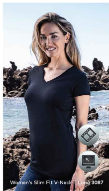
Women's Slim Fit V-Neck-T Long 3087

* colour sports grey: 89% cotton 14% viscose 5% elastane