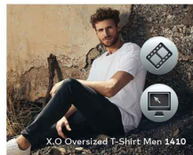
X.O Oversized T-Shirt Men 1410

Unique oversized single jersey T-shirt with self-fabric collar, made from long staple combed cotton. The particularly smooth surface and flowing fabric give the shirt a unique, elastic and silky finish. The T-shirt has an oversized cut and is made with side seams.