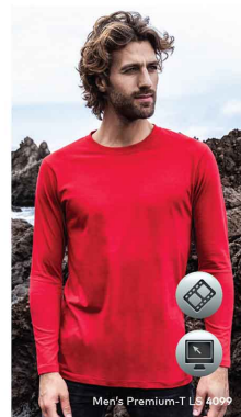
Men's Premium-T LS 4099

Classic single jersey longsleeve T-Shirt with elastane in small rib neckline, produced of long staple combed cotton, the particularly fine surface of the fabric is highly suitable for any kind of textile finishing. The longsleeve T-Shirt has a modern cut and is made from tubular fabric.