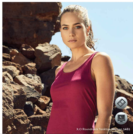
X.O Roundneck Tanktop Women 1451