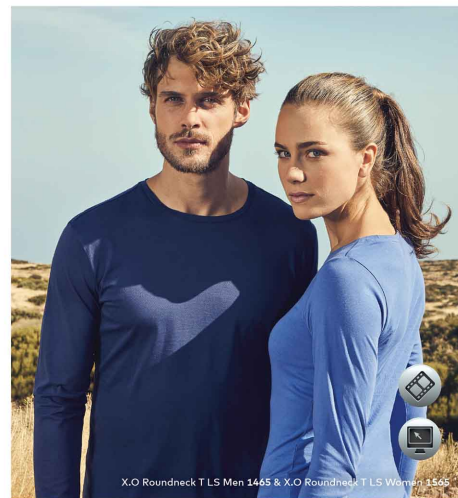
X.O Roundneck T LS Men 1465 & X.O Roundneck T LS Women 1565

Unique single jersey long-sleeved shirt with self-fabric collar, made from long-staple combed cotton. The particularly smooth surface and flowing fabric give the shirt a unique, elastic and silky finish. The T-shirt has a slim fit and is made with side seams.