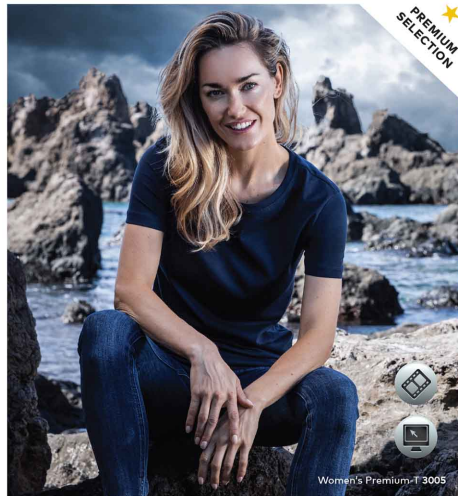
Women's Premium-T 3005