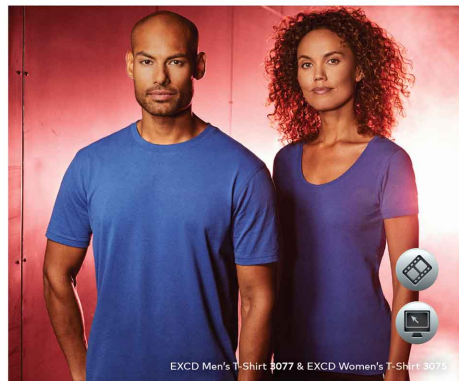
EXCD Men's T-Shirt 3077 & EXCD Women's T-Shirt 3075