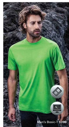
Men's Basic-T 1090

Timeless single jersey T-Shirt with elastane in rib neckline, produced of combed cotton. The T-Shirt has a classic cut and is made from tubular fabric.