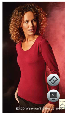
EXCD Women's T-Shirt LS 4095

https://www.promodoro-shop.de/_idn_dsp_product_detail&ART_N=4095