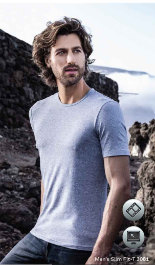
Men's Slim Fit-T 3081