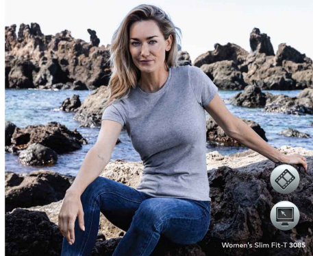
Women's Slim Fit-T 3085