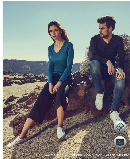
X.O V-Neck T-Shirt Men 1440 &amp; X.O V-Neck T-Shirt Women 1560