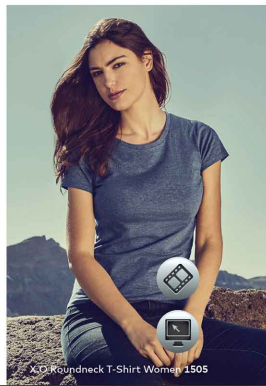
X.O Roundneck T-Shirt Women 1505

Unique single jersey T-shirt with self-fabric collar, made from long staple combed cotton. The particularly smooth surface and flowing fabric give the shirt a unique, elastic and silky finish. The T-shirt has a slim fit and is made with side seams.