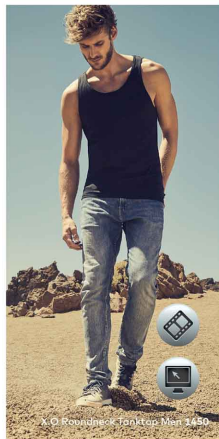
X.O Roundneck Tanktop Men 1450

Unique single jersey tank top with self-fabric collar, made from long staple combed cotton. The particularly smooth surface and flowing fabric give the shirt a unique, elastic and silky finish. The T-shirt has a slim fit and is made with side seams.