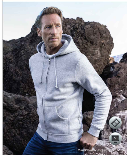
Men's Hoody Jacket 80/20 5182

Colours Women: ● black ● sports grey* ● navy new * colour sports grey: 75 % cotton 17 % polyester 8 % viscose