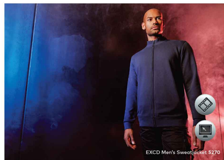
EXCD Men's Sweatjacket 5270

Workwear molton unbrushed mixed fabric sweatjacket with self fabric stand-up collar, half moon in the neck, full-length and concealed tone-in-tone zipper, 2 front zip pockets, elastane sleeve cuffs and waistband, hanger loops fixed inside at side seams, produced of long staple cotton and polyester with VORTEX® Spinning Technology. The extreme smooth surface is pilling resistant and highly suitable for any kind of textile finishing. Shoulder seams with stay tape and double seams as well as back neck tape complete this product. EXCD impresses with outstanding long lasting quality, minimal shrinkage and is easy care. The EXCD sweatjacket has an optimal fit. It's ISO-certified, suitable for industrial washing and, due to its high cotton percentage, it offers maximum wearing comfort.