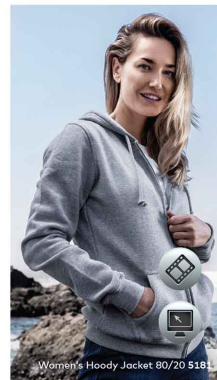
Women's Hoody Jacket 80/20 5181

Classic molton mixed fabric hooded sweatjacket, molton brushed inside, with elastane in sleeve cuffs and waistband as well as a pouch pocket, double hood and full-length and concealed nickel free metal zipper, produced of combed cotton with polyester. The hooded sweatjacket has a modern cut.