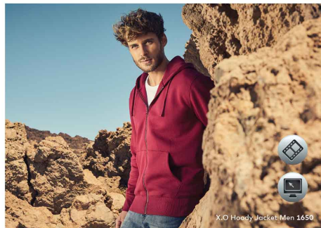
X.O Hoody Jacket Men 1650