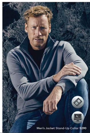
Men's Jacket Stand-Up Collar 5290

Classic molton sweatjacket, molton brushed inside, with elastane in sleeve cuffs and waistband, stand-up-collar, full-length, concealed tone-in-tone zipper as well as 2 front zip pockets, produced of combed cotton. The sweatjacket has a modern cut.