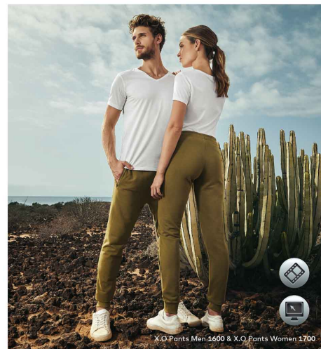
X.O Pants Men 1600 &amp; X.O Pants Women 1700

Unique molton blend sweatpants, unbrushed, waistband with drawstring, 2 side pockets with coated tone-on-tone zip, elastane cuffs at waistband and leg hem, made of long staple combed cotton and polyester. The extra smooth surface and flowing fabric give the sweatpants a unique, elastic and silky finish. The sweatpants have a slim fit.