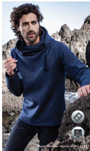
Men's Heather Hoody 60/40 2111

Colour Men: ● heather black ● heather grey ● heather blue