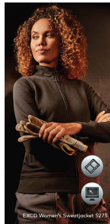
EXCD Women's Sweatjacket 5275

Workwear molton unbrushed mixed fabric sweatshirt with half moon in the neck, elastane sleeve cuffs and waistband, hanger loops fixed inside at side seams, produced of long staple cotton and polyester with VORTEX® Spinning Technology. The extreme smooth surface is pilling resistant and highly suitable for any kind of textile finishing. Shoulder seams with stay tape and double seams as well as back neck tape complete this product. EXCD impresses with outstanding long-lasting quality, minimal shrinkage and is easy care. The EXCD sweatshirt has an optimal fit. It's ISO-certified, suitable for industrial washing and, due to its high cotton percentage, it offers maximum wearing comfort.