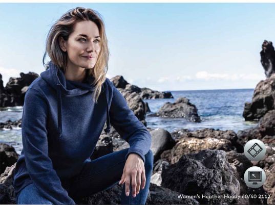
Women's Heather Hoody 60/40 2112