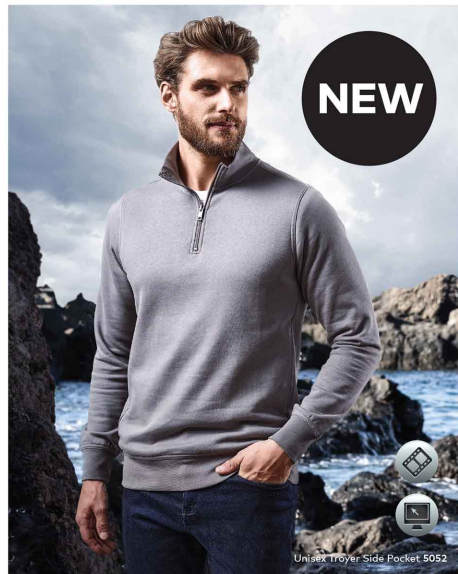
Unisex troyer Side Pocket 5052