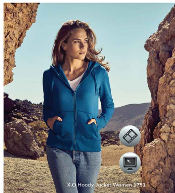
X.O Hoody Jacket Women 1751

Unique molton blend hooded sweat jacket with brushed inside, kangaroo pocket and elastane cuffs, sleeves and hem, made from long staple combed cotton and polyester. The particularly smooth surface and flowing fabric give the sweat jacket a unique, elastic and silky finish. The sweatshirt has a slim fit.