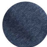
100% cotton surface for optimal print results (Authentic Collection)