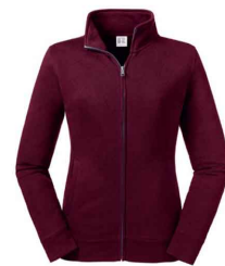
267F Ladies' Authentic Sweat Jacket SIZES XS-XL

Our premium Authentic Sweat Jacket with its contemporary fit and modern design revives the original spirit of the Sweatshirt.