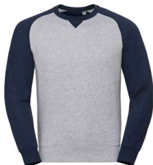
264M Authentic Baseball Sweat SIZES XS-3XL