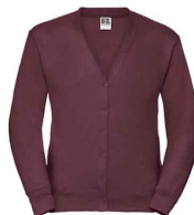
273M Sweatshirt Cardigan SIZES XS-XL