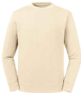
208M Pure Organic Reversible Sweat SIZES XS-3XL