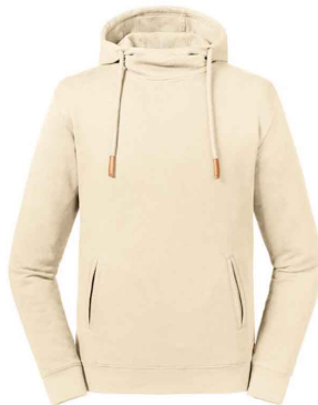
209M Pure Organic High Collar Hooded Sweat SIZES XS-3XL