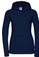
265F Ladies' Authentic Hooded Sweat SIZES XS-XL