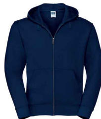
266M Men's Authentic Zipped Hood Jacket SIZES XS-4XL