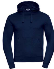
265M Men's Authentic Hooded Sweat SIZES XS-4XL