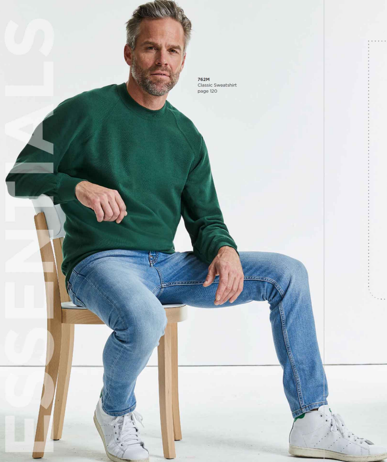
762M Classic Sweatshirt page 120