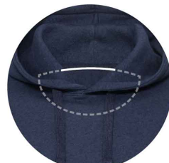
Half moon (double yoke) at the nape of the neck, optimal for rebranding (Authentic melange sweatshirt fabrics, Russell Pure Organic)