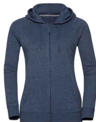
284F Ladies' HD Zipped Hood SIZES XS-2XL