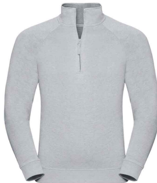
282M Men's HD Quarter Zip Sweat SIZES XS-3XL

Our HD Quarter Zip Sweat is a must have for your wardrobe providing you with a contemporary slim fit in a lighter fabric than traditional sweats.