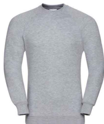
762M Classic Sweatshirt SIZES XS-4XL