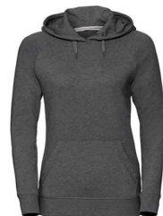
281F Ladies' HD Hooded Sweat SIZES XS-2XL