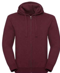
263M Men's Authentic Melange Zipped Hood Sweat SIZES XS-3XL