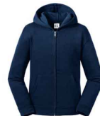
266B Children's Authentic Zipped Hood Jacket SIZES 3-14 Years

Our premium Authentic Zipped Hood with its contemporary fit and modern design revives the original spirit of the Sweatshirt.