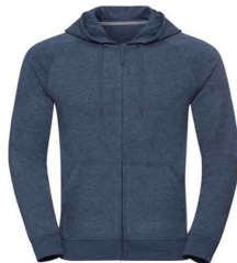
284M Men's HD Zipped Hood SIZES XS-3XL