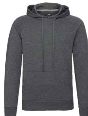
281M Men's HD Hooded Sweat SIZES XS-3XL