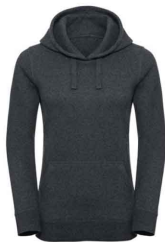
261F Ladies' Authentic Melange Hooded Sweat SIZES XS-XL