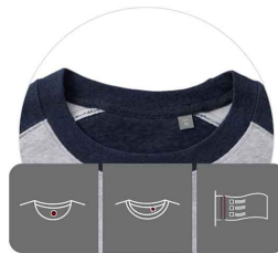
Label free design (Russell Pure Organic, HD Collection, Authentic melange sweatshirt fabrics)