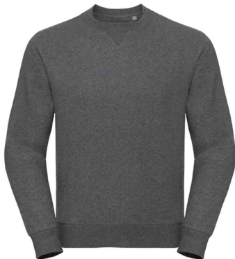
260M Authentic Melange Sweat SIZES XS-SXL

LAUNDRY CARE 40°C machine wash, tumble dry (low temperature)