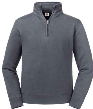
270M Authentic Quarter Zip Sweat SIZES XS-4XL