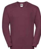
272M V-Neck Sweatshirt SIZES XS-2XL