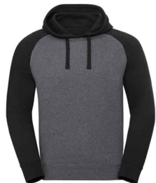
269M Authentic Hooded Baseball Sweat SIZES XS-3XL