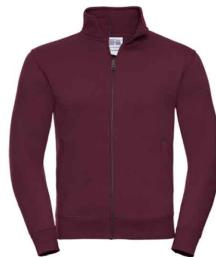
267M Men's Authentic Sweat Jacket SIZES XS-4XL