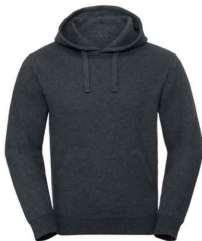
261M Men's Authentic Melange Hooded Sweat SIZES XS-3XL