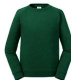
271B Children's Authentic Raglan Sweat SIZES 3-14 Years

Russell's Authentic sweats are built in three layers. On the inside a fluffy mix of cotton and polyester gives comfort and warmth. A middle layer that's 100% polyester adds bulk. The outer layer is 100% cotton which feels good – and gives the best surface for decoration.