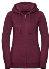
263F Ladies' Authentic Melange Zipped Hood Sweat SIZES XS-XL

LAUNDRY CARE 40°C machine wash, tumble dry (low temperature)