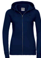
266F Ladies' Authentic Zipped Hood Jacket SIZES XS-XL