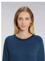
Stella Tripster Denim