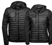
BLACK / BLACK