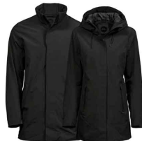
BLACK BLACK MEN'S / STYLE 9608 WOMEN'S / STYLE 9609