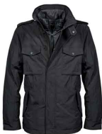
BLACK MEN'S / STYLE 9670