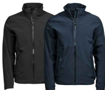
BLACK * NAVY MEN'S / STYLE 9606