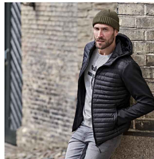
Hooded Crossover Jacket Style 9628