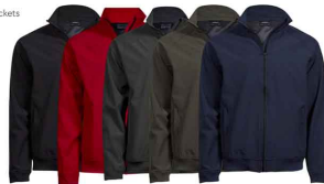
BLACK * RED DARK GREY DEEP GREEN NAVY MEN'S / STYLE 9602