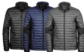
BLACK / BLACK