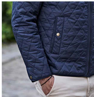
Brass quality metal zippers and buttons