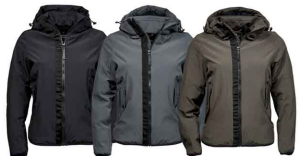
BLACK SPACE GREY DARK OLIVE WOMEN'S / STYLE 9605