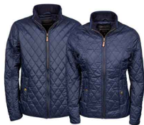
DEEP NAVY DEEP NAVY MEN'S / STYLE 9660 WOMEN'S / STYLE 9661