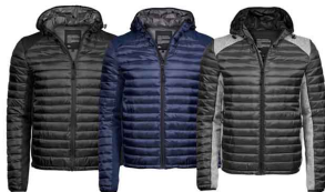
BLACK / BLACK MELANGE

This casual midyear jacket is a combination of our knitted fleece and our 400T sporty ripstop polyester jacket. It has an authentic, casual, and sporty look and is perfect as your daily leisurewear jacket.