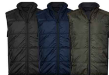
BLACK / BLACK NAVY / NAVY DEEP GREEN / BLACK MEN'S / STYLE 9114