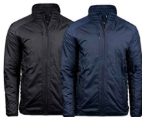
BLACK DEEP NAVY MEN'S / STYLE 9600