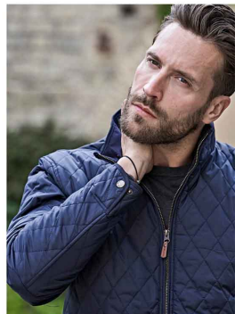
Richmond Jacket Style 9660