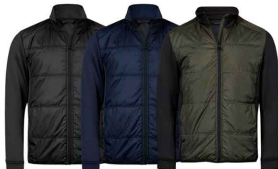
BLACK / BLACK NAVY / NAVY DEEP GREEN / BLACK MEN'S / STYLE 9110