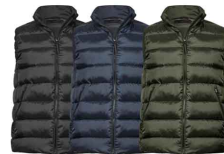
BLACK* NAVY DEEP GREEN MEN'S / STYLE 9648