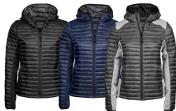
BLACK / BLACK MELANGE