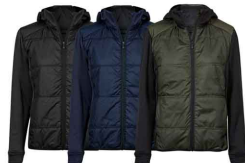
BLACK / BLACK NAVY / NAVY DEEP GREEN / BLACK WOMEN'S / STYLE 9113