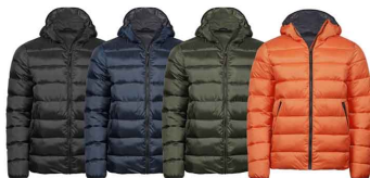
BLACK NAVY DEEP GREEN DUSTY ORANGE MEN'S / STYLE 9646

This lightweight padded jacket with hood is made of recycled polyester and insulated with 25% extra premium DuPont™ padding than style 9644. The matte textured 1x1 ripstop fabric and clean Scandinavian design give this jacket a modern silhouette. It features a quality SBS zipper, inner pocket, two large front pockets, and is designed with invisible elastic cuffs.