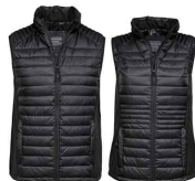
BLACK / BLACK MEN'S / STYLE 9624 BLACK / BLACK WOMEN'S / STYLE 9625