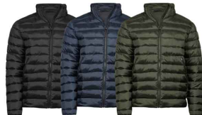
BLACK* NAVY DEEP GREEN MEN'S / STYLE 9644