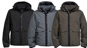
BLACK SPACE GREY DARK OLIVE MEN'S / STYLE 9604

Premium outdoor jacket crafted in a two-layered performance material with a detachable hood. The jacket has water-repellent skills and is insulated with high-quality DuPont™ padding. Black dull trim contrast gives the jacket an urban edge. Functional features perfect for outdoor activity. The jacket has a double pocket opening with a discreet zip puller and a flap with black metal snap buttons. This jacket will provide you with excellent warmth, amazing durability, and an urban outdoor look.