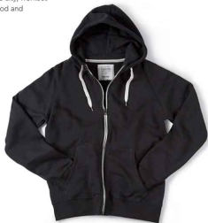
MEN'S / STYLE 5402