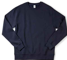
MEN'S / STYLE S100