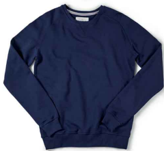
MEN'S / STYLE 5400