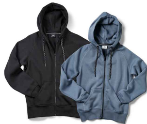
MEN'S / STYLE 5435

A full-zipped fashion hoodie with a shaped fit. The contrast strings and neckband adds a stylish touch to the hoodie, which features elastic cuffs and waistband.