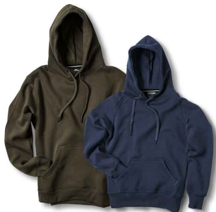
MEN'S / STYLE 5430

Heavyweight hooded sweatshirt featuring a large front pocket and an adjustable hood with double-stitched elastic cuffs and waistband.