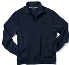
MEN'S / STYLE 5438