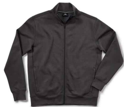
MEN'S / STYLE 5440