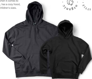
MEN'S / STYLE S102 JUNIOR / STYLE S1028