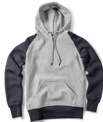
MEN'S / STYLE 5432

This two-coloured version of our bestselling Hooded Sweatshirt is an excellent choice for a sporty look and a casual feel.