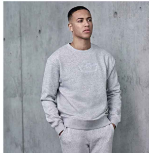
Heavy Sweatshirt Style 5429