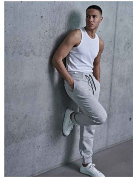
Sweat Pants Style 5425