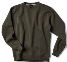
MEN'S / STYLE 5429