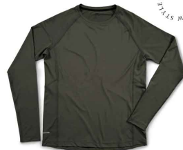
MEN'S / STYLE 7022

This Long Sleeve CoolDry Tee with flat lock seams ensures the best comfort. The tee is tailored fit with added stretch for better movement. It is moisture-wicking, quick-drying, and easy to wash and care.