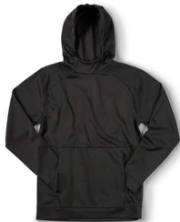
MEN'S / STYLE 5600