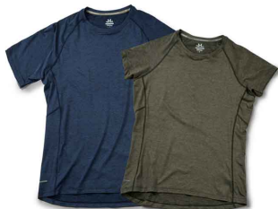
MEN'S / STYLE 7020

Our signature premium functional tee with stretch is made from a soft, lightweight, breathable fabric that makes for a great, natural feel. For this premium performance tee, we have used CoolDry fabric to ensure maximum comfort and performance.