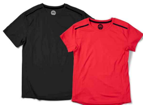
MEN'S / STYLE 7010