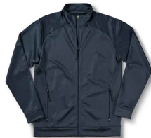
MEN'S / STYLE 5602