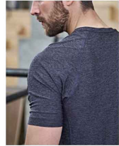
CoolDry Tee Style 7020

Our signature premium functional tee with stretch is made from a soft, lightweight, breathable fabric that makes for a great, natural feel. For this premium performance tee, we have used CoolDry fabric to ensure maximum comfort and performance.