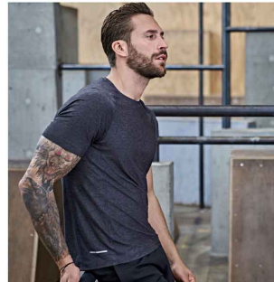
CoolDry Tee Style 7020